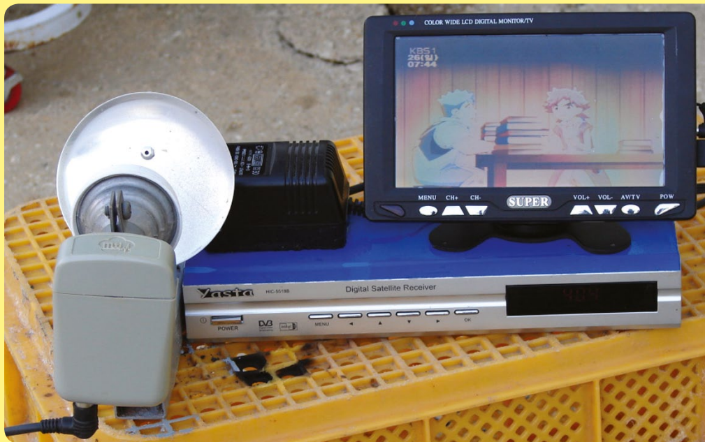
■ A satellite dish doesn't need to be big: this small lid also does the trick.