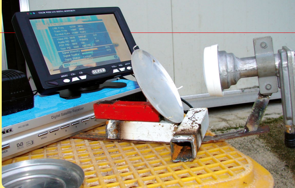
■ A small lid works too!