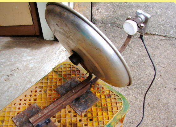
■ A cooking pot lid reflector with thanks to Jang Lee's grandmother for supplying the lid.