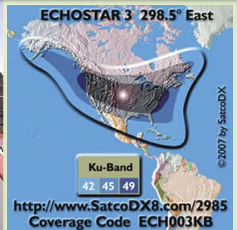
■ The footprint is far from reaching Europe – or so the theory goes. In the real world, reception is very well possible in the western fringes of Europe.