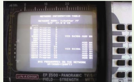
■ Diego's satellite meter shows the NIT table of one of the transponders of ECHOSTAR 6A he is receiving