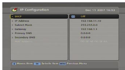
LAN Settings |