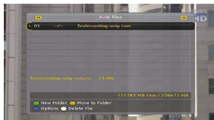
DivX Player |