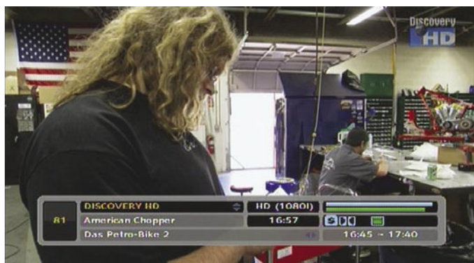
HDTV Reception / Info Bar |

The rear panel of this new Topfield receiver is also very nicely appointed: in addition