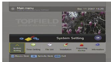
Main Menu |

To top it all off, Topfield provided this new receiver with a number of extra goodies including a DivX and an MP3