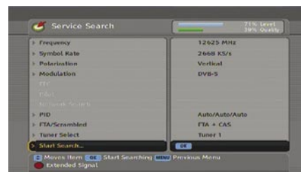
Channel Scan and SCPC Reception |