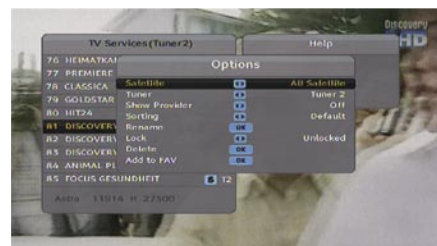
Channel List |