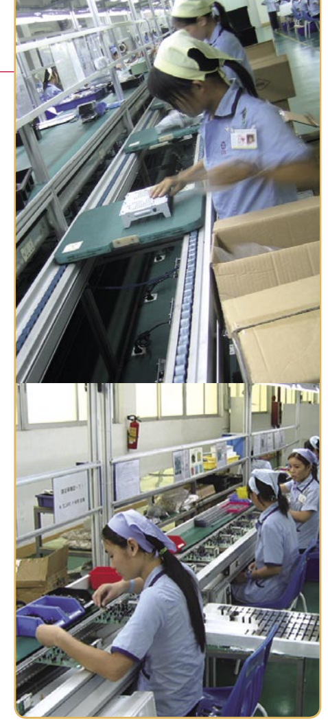
A look at the assembly line in DongGuan

ARION has the entire world within their field of view. Their receivers are exported to every corner of the world and are matched to local requirements. In the early days, the incredibly tiny receiver that carried the model number AF-1000 was a bestseller. Today, they are mainly focusing on sales of newly developed HD, PVR in retail market and also signed some big contracts with service providers with various CAS / Middleware integrated STBs.